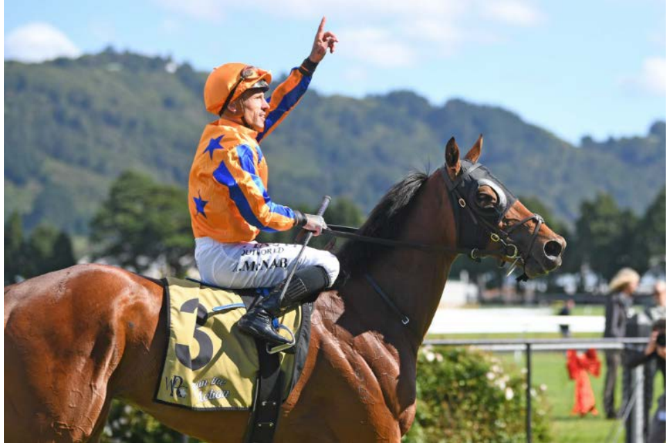
Prise De Fer