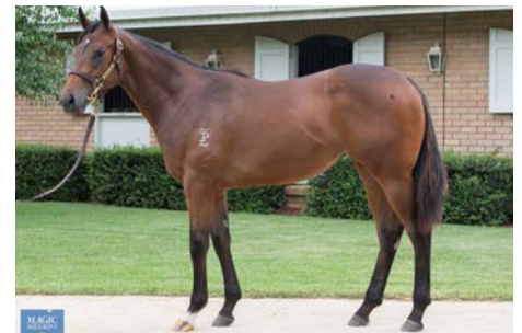
Girl pictured as a yearling

She's still learning, she's not the finished article but she's definitely a promising filly."