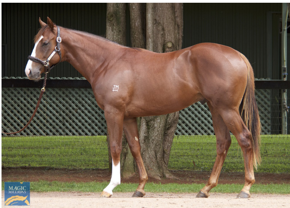
Zoukerino pictured as a yearling

Maiden Plate (1100m), Kensington, July 20