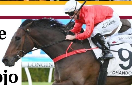
Jojo Was A Man

The Tait name is synonymous with Australian racing and breeding, Sandy owning numerous elite horses over many decades - none more so than Tie The Knot (Nassipour) - while studmaster Olly Tait is one of the most respected industry figures around the world.