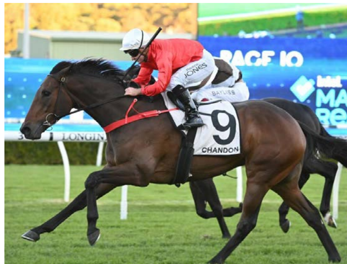
Jojo Was A Man

Her racetrack deeds were enough to convince the majority of the