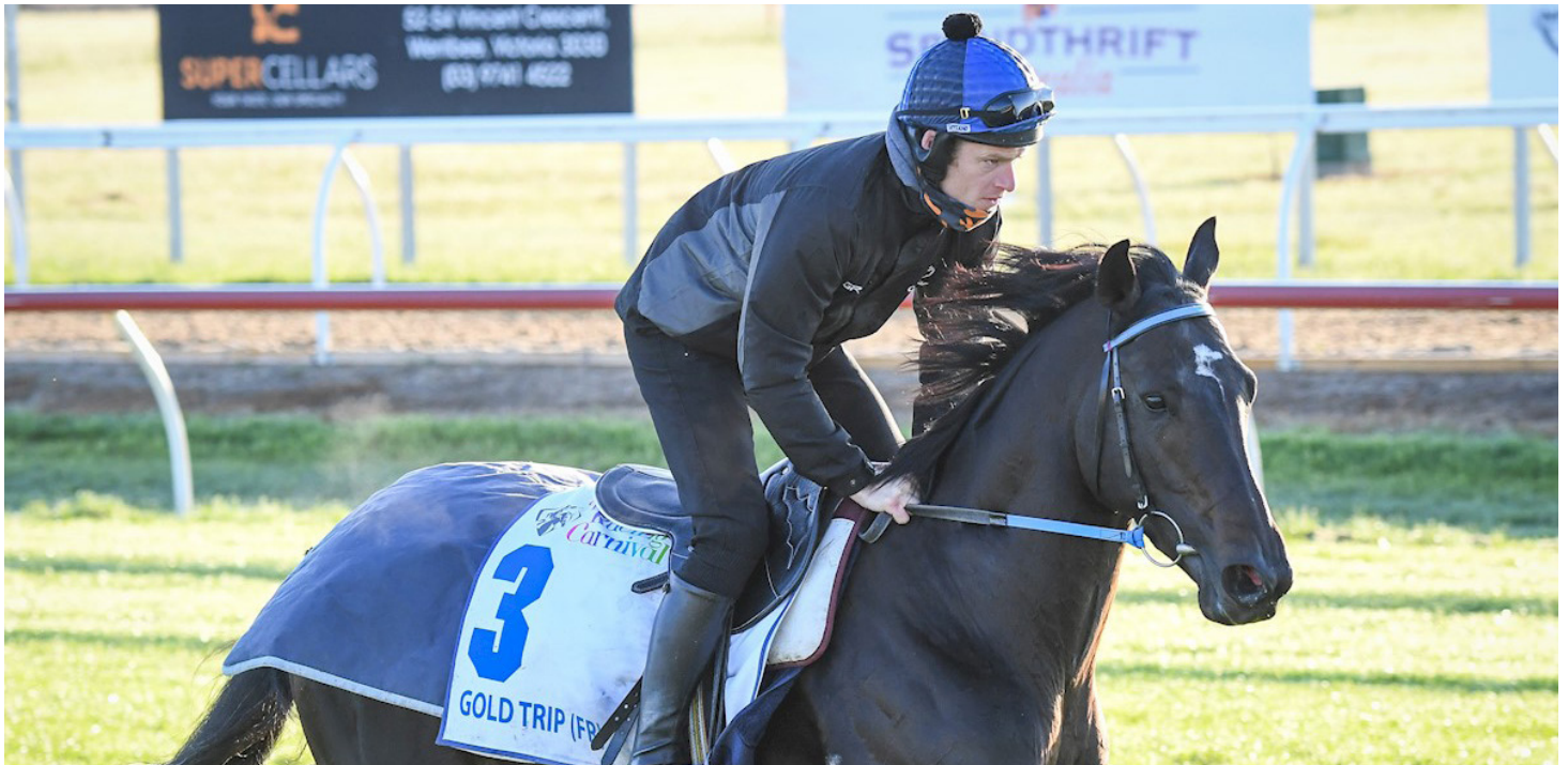
Gold Trip working at Werribee