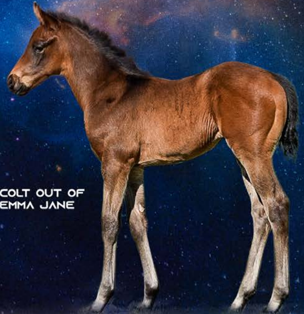
COLT OUT OF EMMA JANE