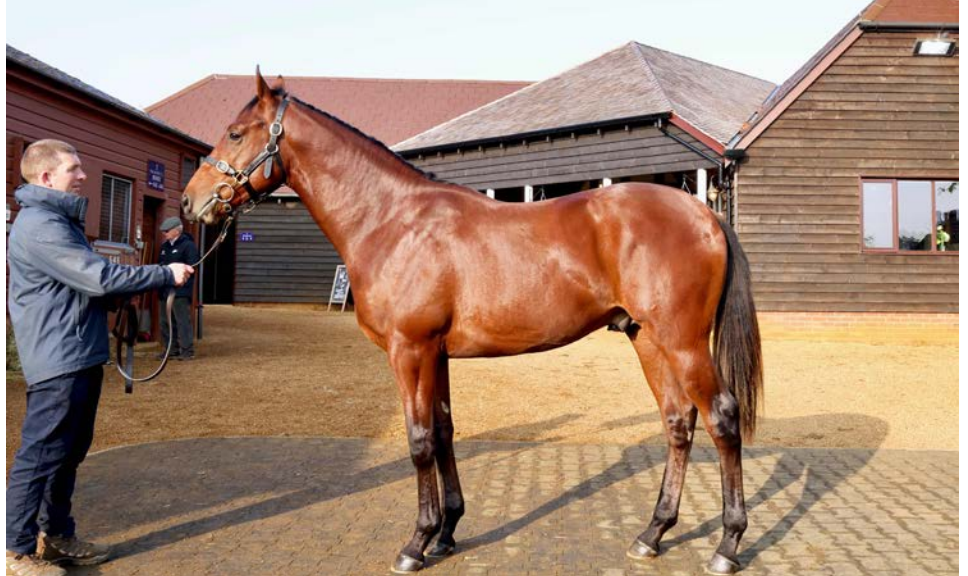
Lot 1108 Lope De Vega - We'll Go Walking colt

Catalogued as Lot 1123, the filly is out of the placed Redoute's Choice (Danehill) mare Wynola, while further back this is the same family as Group 1 winner Turtle Bowl (Dyhim