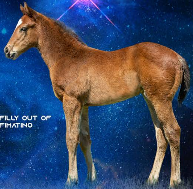
FILLY OUT OF FIMATINO