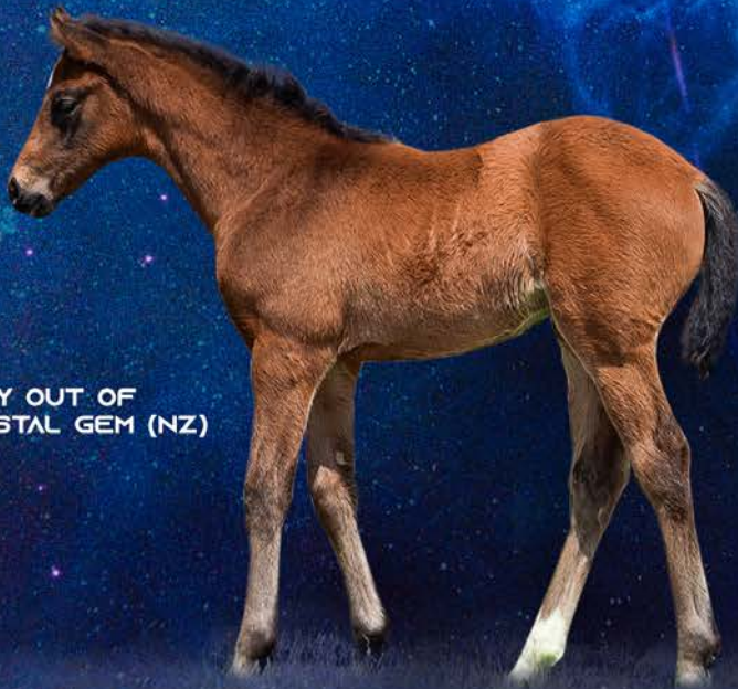
FILLY OUT OF COASTAL GEM (NZ)