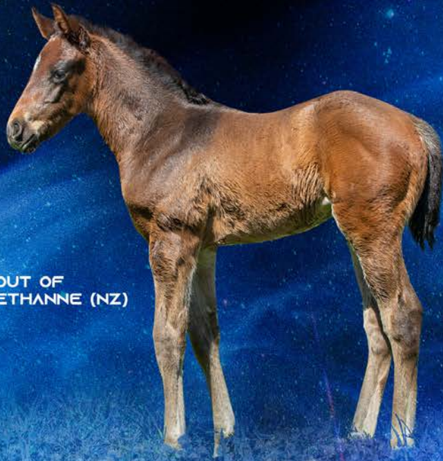
COLT OUT OF GWYNETHANNE (NZ)