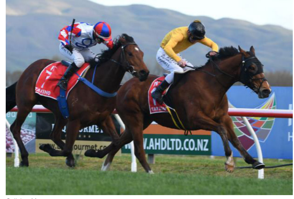
Callsign Mav NZ RACING

are glorious examples of the great equaliser – performance on the track. On the racetrack, horses neither know their pedigree nor their purchase price.